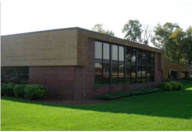
Westview Business Center South